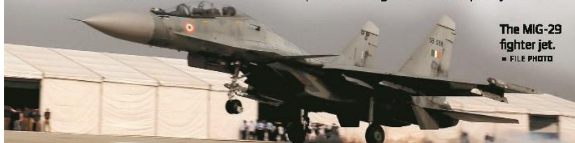
The MiG-29 fighter jet. = FILE PHOTO

4 Deals also include a Long Range Land Attack Missile System of over 1000 km-range and ASTRA, a Beyond Visual Range class of Air-to-Air Missile for fighter aircraft designed and developed by the DRDO